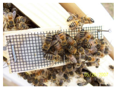
Queen in a cage

The package of bees usually contains bees shaken from two or more colonies, and the queen supplied with the package is bred from selected colonies to be sent in the package. The queen is kept in a separate small wooden or plastic cage with one screened side and candy release plug. The caged queen in the package is well protected and fed through the screen during transportation, and usually accepted by the bees within 12-24 hours. The bees free the queen to leave the cage by eating the sugar candy blocking the exit hole of the cage.