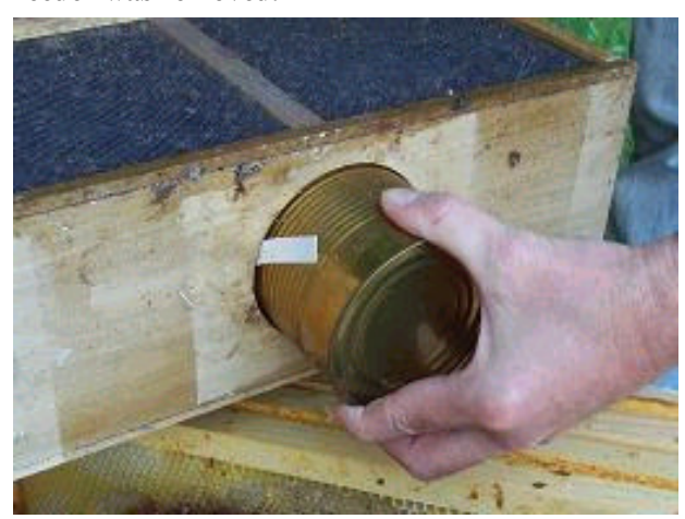
Removal of can feeder

5) Check the queen to make sure she is alive. Remove the cork or any cover blocking the candy end of the queen cage and poke a hole through the candy with a nail or a matchstick, being careful not to impale the queen. The hole should be large enough so the bees can release the queen within 24- 48 hours, but not so large that the queen can get out immediately.