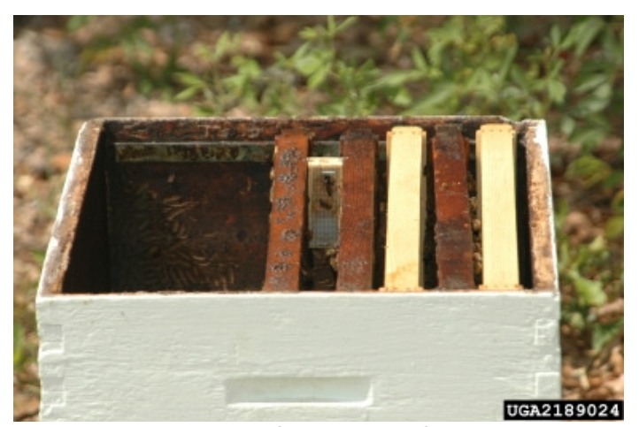
Queen cage between two frames

6) Place the queen cage vertically between two frames in the middle of the hive, with the candy end up. The screen on the queen cage should face either the right or the left of the hive and not the comb. Bees should have access to the screen face of the queen's cage so that they can feed her and receive her scent. Other way to insert the cage is to place it tightly between the top bars of two combs, screen face down. The bees will eat through the candy plug and free the queen.