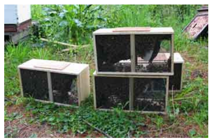
Packages of bees ready for hiving

Khalil Hamdan, Apeldoorn, the Netherlands