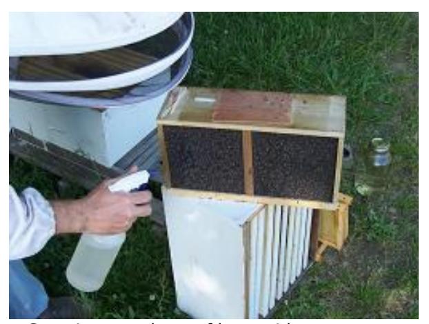
Spraying a package of bees with sugar syrup