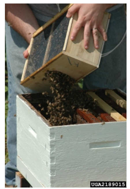
The bees are shaken into the hive