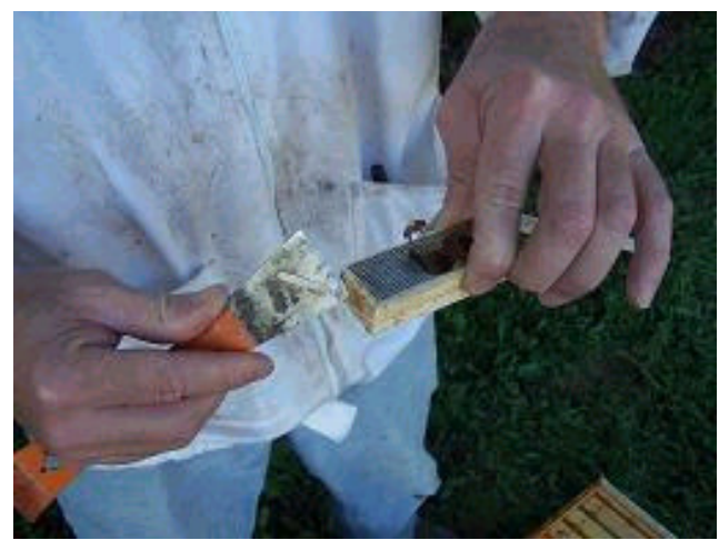
Removing the cork covering the candy plug

6) Place the queen cage vertically between two frames in the middle of the hive, with the candy end up. The screen on the queen cage should face either the right or the left of the hive and not the comb. Bees should have access to the screen face of the queen's cage so that they can feed her and receive her scent. Other way to insert the cage is to place it tightly between the top bars of two combs, screen face down. The bees will eat through the candy plug and free the queen.